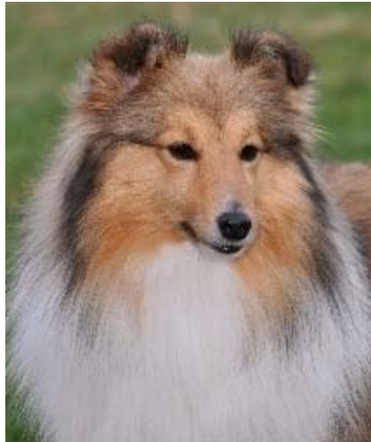
Bitch CC And Best Of Breed: Ch Tighness Three Steps T'Heav'n

http://crufts.fossedata.co.uk/Breed.asp?ShowYear=2011&GroupID=PAS&ScheduleID=83