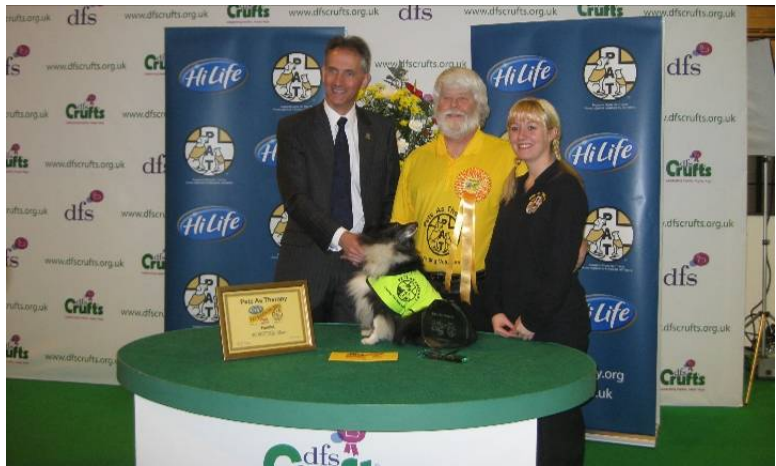
Once again, many thanks to all who voted for and supported Esme.