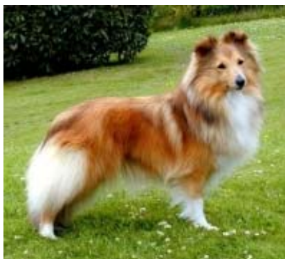
Lady, my very special girl.

Everyone that met Lady loved her, she was friendly to all and was very much part of our family and has left a massive void. She was a lady by nature and Lady by name.