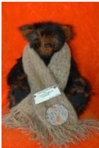
Canada