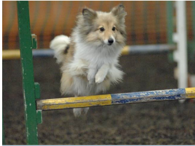
Drew's Animal Photography - www.drewsanimalphotography.co.uk